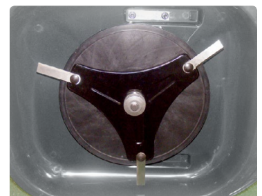
STAINLESS STEEL FLAIL BLADES