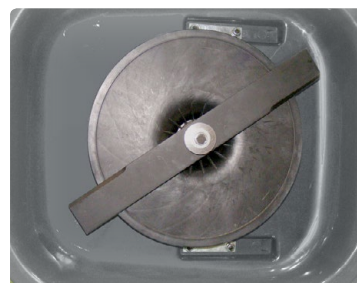
HEAVY-DUTY STEEL BLADE