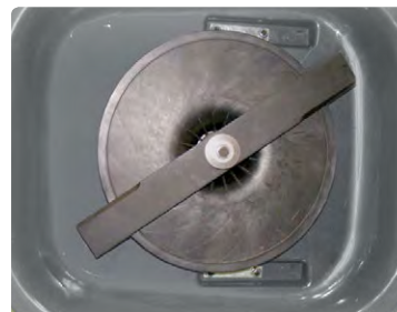
▶ HEAVY-DUTY STEEL BLADE