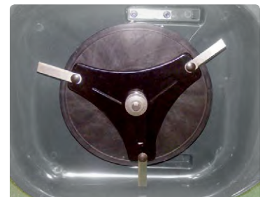
▶ STAINLESS STEEL FLAIL BLADES