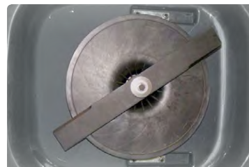
➤ HEAVY-DUTY STEEL BLADE