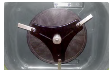
➤ STAINLESS STEEL FLAIL BLADES