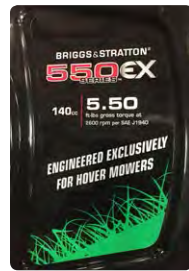
➤ EXCLUSIVE LIGHTWEIGHT BRIGGS & STRATTON ENGINE GENERATES GREATER LIFT